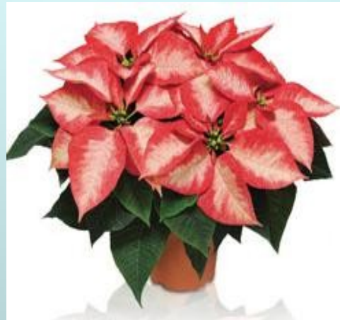
Ice Crystals Poinsettia

4 ½" $7.00 6 ½" $15.00 8 ½" $26.00 - red only