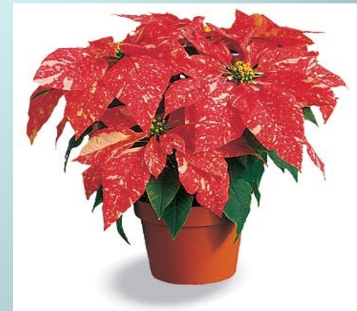
Red Glitter Poinsettia