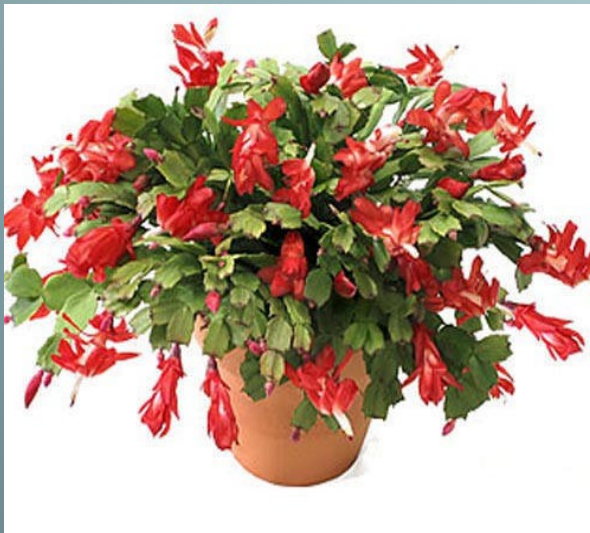
Christmas Cactus (colors vary)