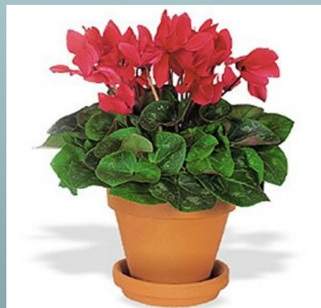
Cyclamen (colors vary)