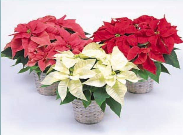
Poinsettias – Pink/White/Red

Student prints this picture sheet from the Band Website